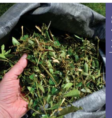
Separate plant waste from landfill debris