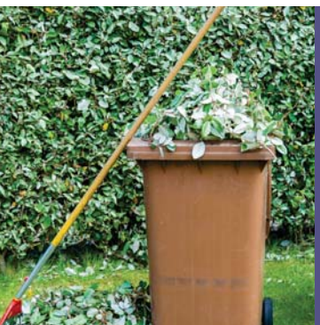
Use a green waste bin