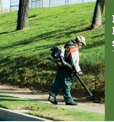
Never blow leaves into the street